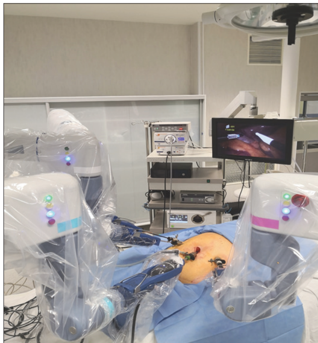
Figure 1. Docking of robotic arms

surgical robot was then brought into position and docked. When performing cholecystectomy with the Senhance, TransEnterix robotic system, 3 independently usable robotic arms are used (Figure 1). To prepare, we regularly use a monopolar hook (right hand/right robotic arm) and a bipolar grasper (left hand/left robotic arm) (Figure 2). The third arm is used as a camera holder. An integrated 3D camera with 16-fold magnification offers a very high-quality visible field and precise assessment of thinnest tissue structures. With ‘Eye-Sensing Control’, the camera can be maneuvered precisely by the eye movements of the surgeon after the initial calibration from the console (Figure 3). The dissection was performed according to the standard laparoscopic technique. After clear identification of the cystic duct and cystic artery, the cystic duct was ligated manually with clips. The cystic artery was coagulated or clipped just around the gallbladder. The gallbladder was dissected from the bed. Once fully dissected, the gallbladder was removed through the umbilical 18 mm port. The robot was then withdrawn, and the 18 mm port