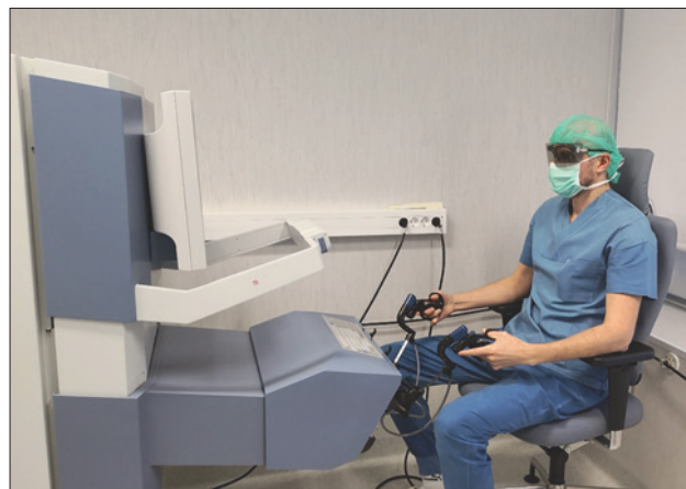
Figure 3. Surgeon works at console